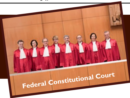
Federal Constitutional Court